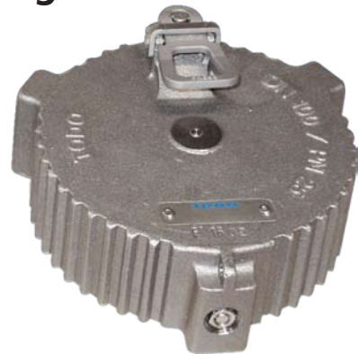
4" (DN 100) PTC