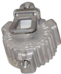
2" (DN 50) PTC