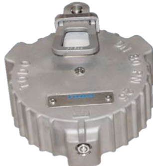
3" (DN 80) PTC