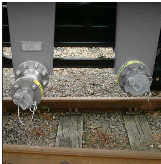
Approved as third closure for category II product.

Should the operator still choose to remove the cap it will reduce the static pressure to zero thus preventing the forceful expulsion of the transfer media.